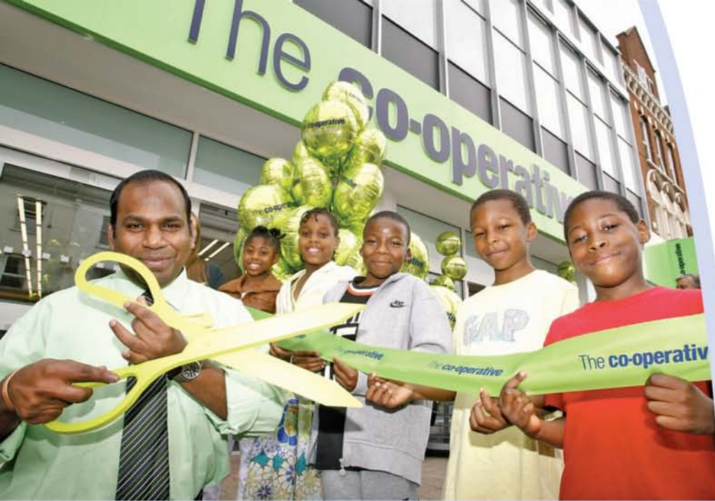
Grand opening of The Co-operative Group's grocery store in Clapham, England.